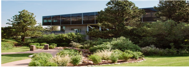
Doolittle Hall, located on the United States Air Force Academy, sits on 24 acres of scenic Colorado landscape.

Doolittle Hall 3116 Academy Drive USAF Academy, CO 80840